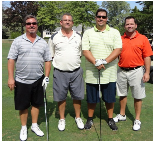
Tournament Winners—UPMC For Life Team